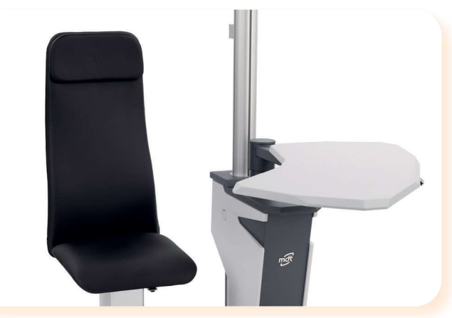
UNIQ with SLIM chair (right-handed setup)