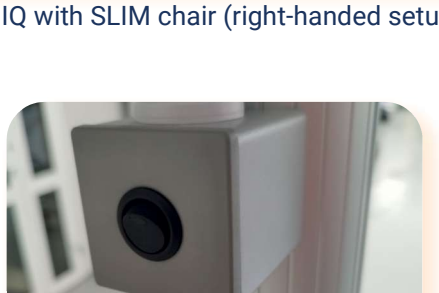
LED lamp switch