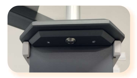
Table top electromagnet lock switch